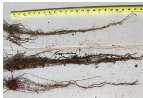
Figure 2. Root tube demonstrations of bermudagrass in a sandy soil, clay soil, and acidic soil (pH ~5) show producers the importance of soil pH and texture on root systems. Typically, a sandy soil (top) will show a deep-rooted system with little branching, while the clay soil (center) is characterized by vertical roots and horizontal branching. The acid soil (bottom) demonstrated how poor soil pH can stunt both root and foliar growth because of limited nutrients.

The effects of soil pH were shown with bermudagrass grown in root tubes (Figure 2). In a highly acidic soil, plant growth can be stunted due to limited nutrient availability, leading to shorter roots with fewer root hairs for nutrient uptake.