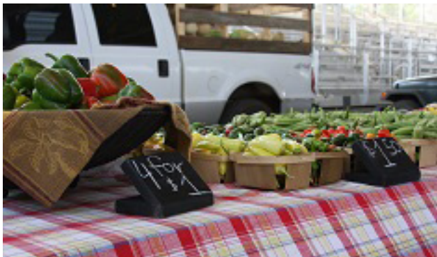
Produce arriving at the farmers market in Henry County, GA.

For many farmers on small and beginning farms, selling produce at the local farmers market or through CSAs is a great way to add to your income while serving consumers who want to purchase locally grown products. The goal is to keep these foods fresh, nutritious and safe. Food safety depends on how the food is grown and handled on the farm, as well as, during transport and at the market.