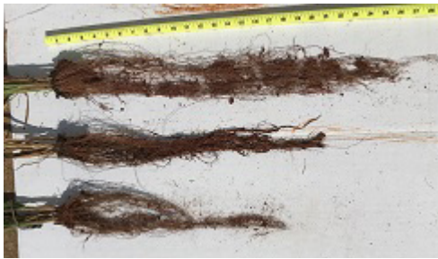
Figure 3. Grazing interval root tubes demonstrate the importance of rotational grazing and pasture rest for pearl millet root development. Management ranges from a 2-day cutting interval, representing overgrazed pastures (bottom) with short, stunted roots and little forage top growth to a well-rested, 21-day cutting interval (top) that show an extensive rooting system with root hairs and fungal mycelium. The 7-day cutting interval (center) represents a typical continuous management scenario.

Bio-management, however, does not just include the microbes. It also affects the way the forages and cattle are managed. Additional forage root tubes showed participants how their grazing management program might affect the forage resiliency in their pastures. Pearl millet and bermudagrass were grown in root tubes and then cut at 2, 7, and 21 days to simulate the improvements when forage crops are given more rest between grazings. When the tubes were opened, participants could see how the over-grazed plants were prevented from building deeper and larger roots. The short, stunted roots on the over-grazed plants contrasted with the roots of plants given proper rest. More rest resulted in a deeper, more-extensive root system with fine lateral roots and mycelia growth extending through the soil profile (Figure 3).