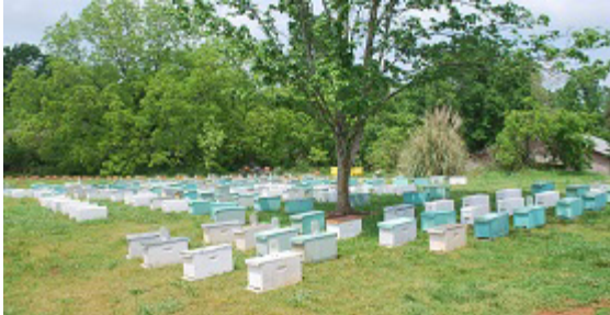
A beehive holding yard with “Nuc packages” for pick-up.

The business also sells “Nuc packages” of bees to both new beekeepers who are just getting started as well as established beekeepers who are looking to increase the size of their operation or replace colonies that have not survived. A package consists of about three pounds of bees secured in a screen box, with the queen caged separately. Then, once the package is sold, the bees must be placed into a hive along with the queen so the hive can begin growing and producing honey.