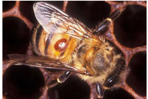
The Varroa mite ( Varroa destructor ) is an external parasitic mite of the honey bee, Apis mellifera . They are visible to the naked eye and look somewhat like a tick. Varroa mites are transported from colony to colony by drifting or robbing bees. Most infected colonies die within 1 – 2 years if not promptly treated for.

As for pesticides, the Jarretts practice caution when setting up their hives on the road, as certain pesticides can be particularly harmful to bees, especially when people are not educated on proper pesticide application practices. Backyard beekeepers can educate their neighbors about the negative impacts misusing pesticides has on bee and other pollinator species, and can promote sustainable landscape practices that help attract bees and other pollinators to their yards and gardens. Slade warned that the biggest threat to bee populations is the varroa mite, and without proper control of the parasitic mite, both backyard and commercial beekeepers will surely lose their hives.